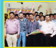
ONE SILENT RESIDENTIAL CHALLENGE IN CUTTACK TO ACHIEVE MORE FROM YOU! MARK IN PRICE - 2019